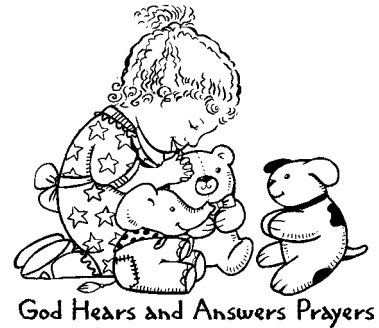
God Hears and Answers Prayers